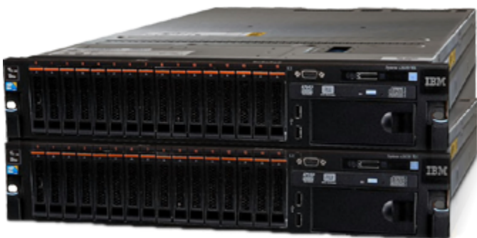
IBM PureData System for Analytics N3001-001 appliance

Powered by IBM Netezza® technology, the PureData Mini Appliance includes an asymmetric, massively parallel processing architecture that is optimized to run complex analytics on terabyte data volumes—10 to 100 times faster than traditional custom systems. 1 Fast query performance on analytical workloads enables rapid, responsive decision making anytime, anywhere to manage risk, enhance service quality, and improve business strategy and efficiency. With the ability to view information and events as they unfold, line-of-business managers can make smart predictions about customer needs and behaviors that drive revenue, increase loyalty and enhance satisfaction.