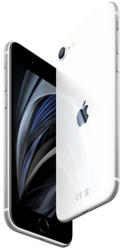
iPhone SE. Productivity packed.