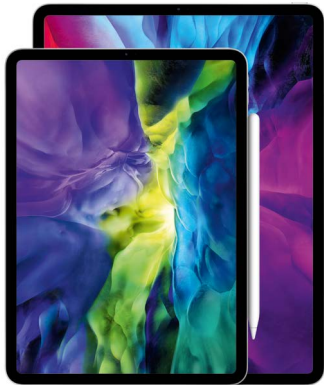
iPad Pro. All screen. All business.