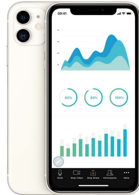
iPhone 11. Ready for business.

iPhone SE is ready to work. Check in with your team over Group FaceTime. Scan and sign documents in Notes. Keep all your work docs at hand in the Files app. And get the most popular apps for business from the App Store. Touch ID lets you easily unlock your device and authenticate apps with just a touch while keeping your phone and corporate data secure. With the fastest chip in a smartphone and long battery life, it's easy to stay productive. All day long.*